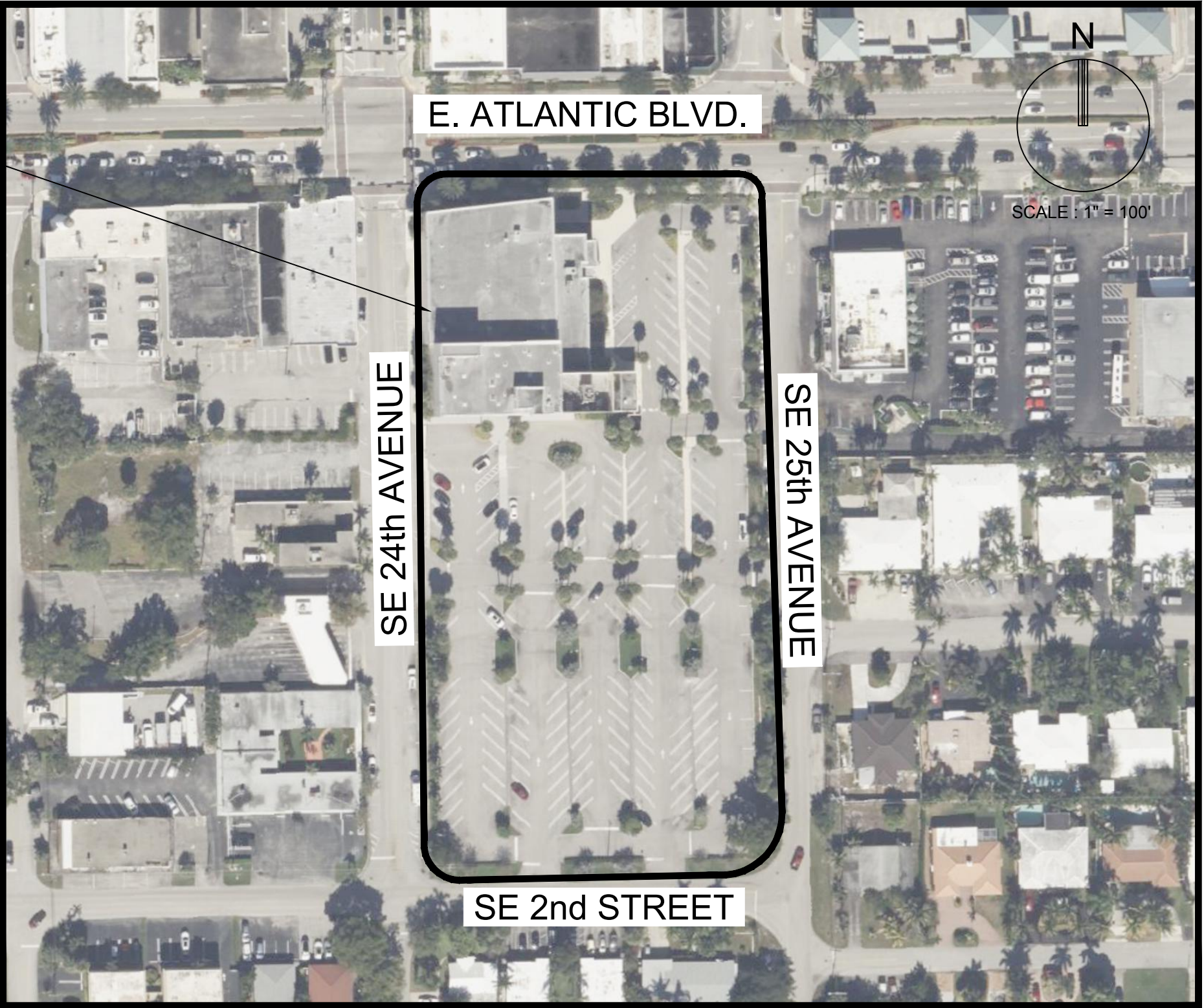
LOCATION MAP SECTION 05, TOWNSHIP 48 S, RANGE 43 E FOLIOS #484331050040, 484331050100

THESE PLANS MAY HAVE BEEN REDUCED IN SIZE BY REPRODUCTION. THIS MUST BE CONSIDERED WHEN OBTAINING SCALED DATA.